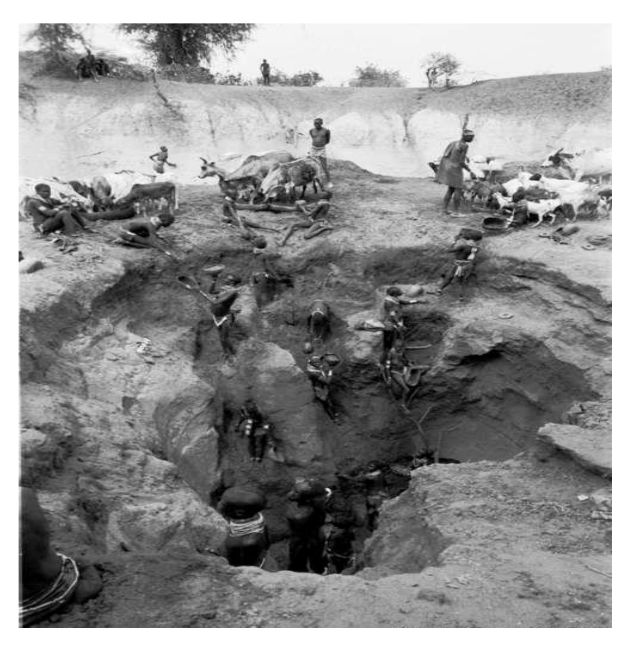
Figure 2. Extracting drinking water during dry season is not an easy for Nyangatom community dig deep well into the land, Ethiopia.