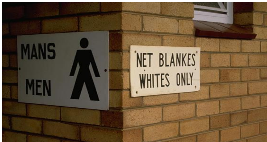
Toilets for whites only during the apartheid South Africa