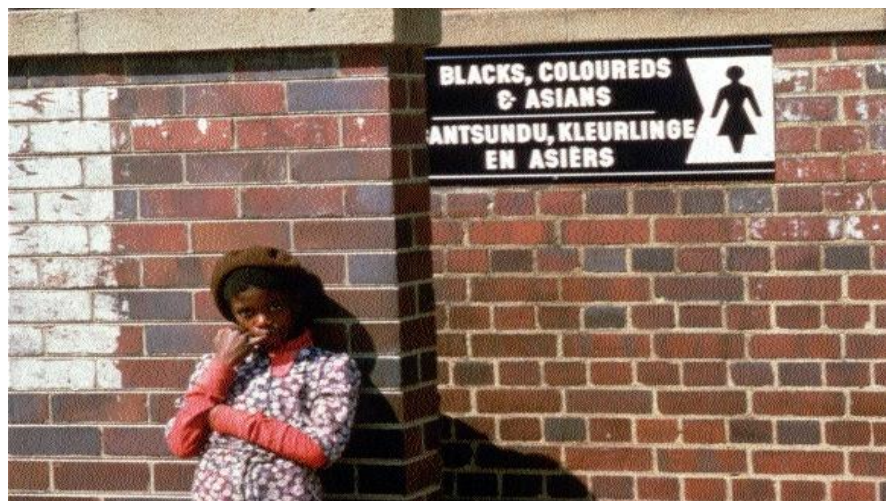
Toilets for blacks only- during apartheid South Africa