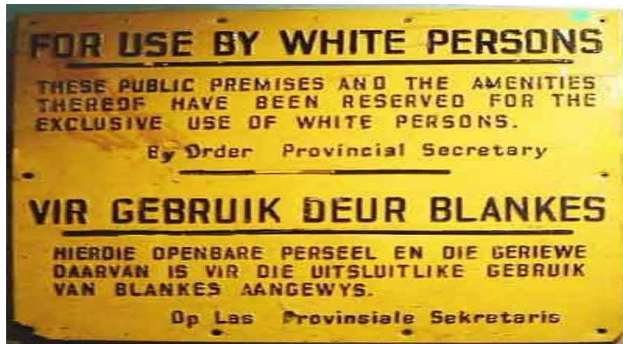
Sign used during apartheid rule of South Africa separating whites and blacks.