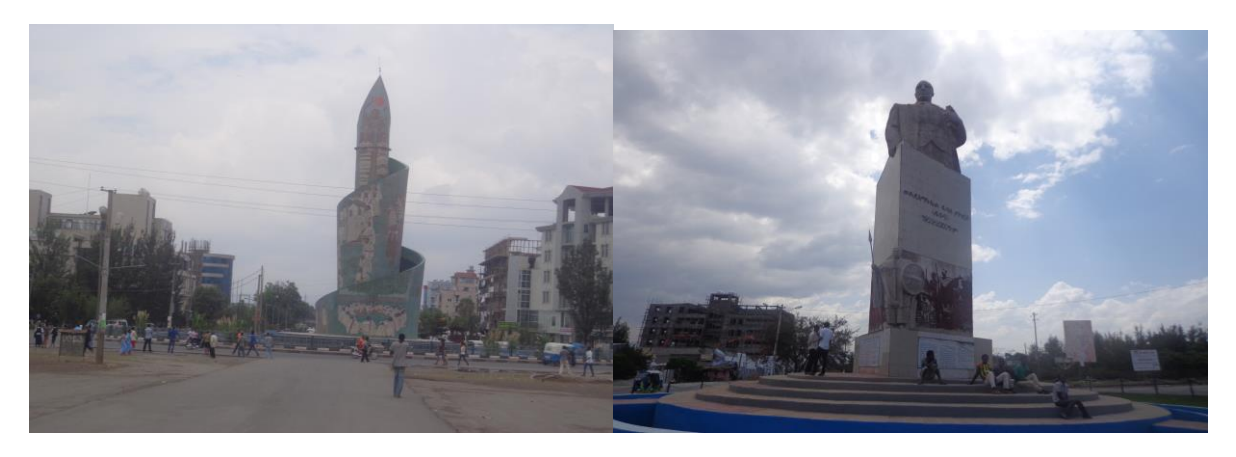
Figure 6: Sidama Sumuda