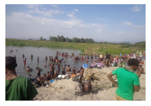
Figure 9: Burkita Hotspring

This tourist attraction was rated as not known by majority of respondents representing 87.7% (Table 1). Only 12.3 % of respondents who were domestic knew it. From this, it can be concluded that the hot spring was not visited by international visitors. All three local guides interviewed said that they used to take to the hot spring before months, however due to disallowing of taking pictures they are now being stopped taking tourist to the hot spring. Interview made with concerned government body representative revealed that such problem was happened because local had a threat of losing their free access to the resource which caused by the news that says the hot spring is to be sold to investor. According to him, the resource was supposed to be sold to investor, but eventually due to local people claim and comment, decision was made in favor of local.