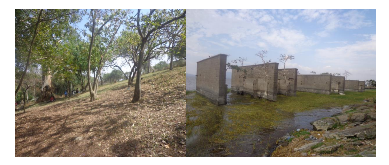
Figure 4: Gudumale recreational and remnants of Ras Mengesha Seyoum presidential palace

Fiche Festival is Sidama ethnic people's new year annual festival. The fiche is beautifully celebrated at Hawassa city in particular place called Gudumale. The New Year is varying every year; it could fall on either of the following months: July, August and September. For example, New Year of last year was celebrated on August but this year it was celebrated on July. The festival is celebrated by Sidama ethnic group for about two weeks. Nevertheless, officially, it is celebrated for two consecutive days at Gudumale. The first day, the eve of the New Year is called Fiche and the second day; New Year day is called Chembelala. It is in these two days people gathered at Gudumale which enable tourist experience and attend the event (fig. 4). Elders come from the different districts of Sidama zone and show performance in front of people gathered.