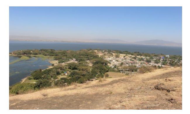
Figure 2: Lake Hawassa (photo by Ermias Kifle, 2014).

Lake Hawassa comprises Small Island called Teha Goda Island, which located at center of the northern direction of the lake. This island is home to many aquatic birds whereby ornithologist can spot different species of birds. The lake is rich in aquatic birds and hippopotamus. Hence, tourist can spot and watch hippos and birds respectively.