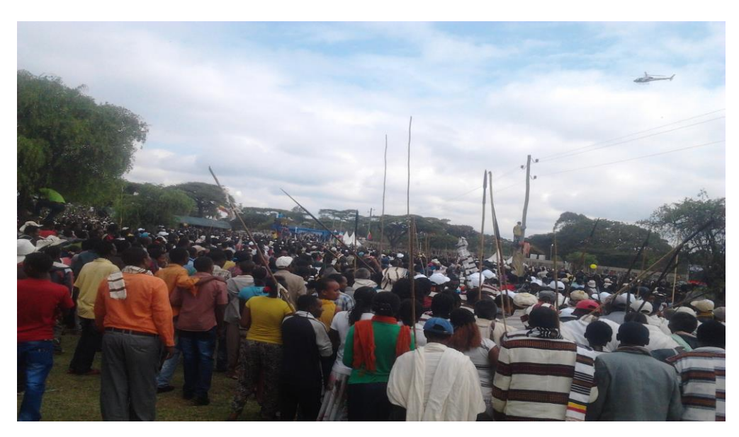
Figure 5: Fiche Festival at Gudumale (Photo by Ermias Kifle, 24/07/2014)