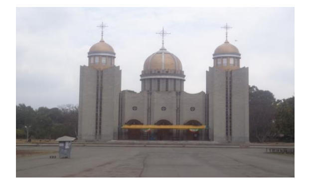
Figure 8: Saint Gabriel church

Every weekend Sunday school is open. For someone who wanted to see how Sunday school look like can go and experience it. For others who wanted silence and meet with God can also have such environment in the church.