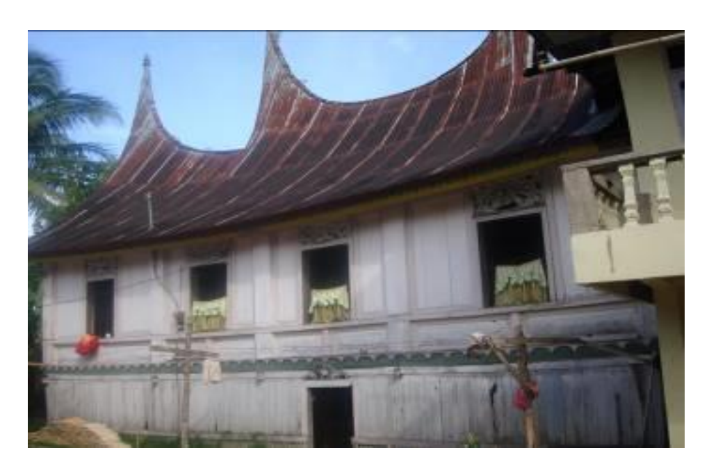
Figure 1: A traditional house in the neighbourhood of the conflict (Photo by the author Dec. 2009).

The sub-clans can be divided into genealogical segments which are called paruik (Kato 1982, p. 45). Often such a genealogical segment lives in a traditional house (rumah gadang - big house) (see Figure 1).