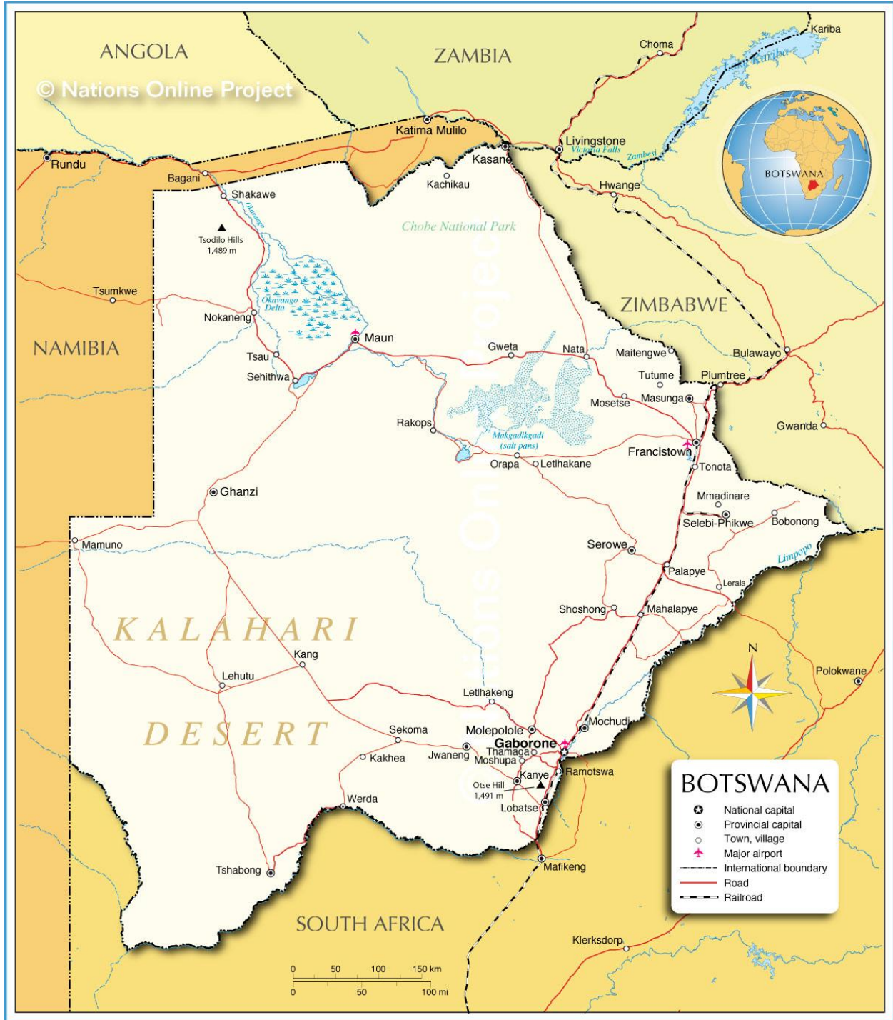
Figure 2. Map of Botswana