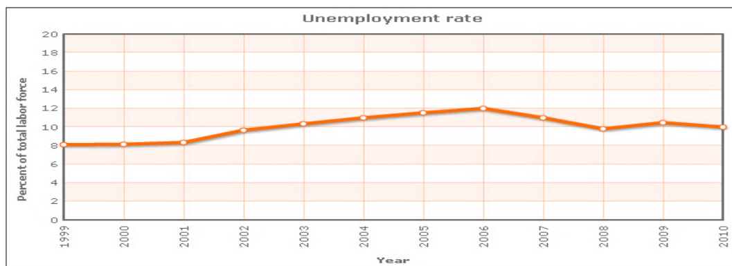
Figure 2. Unemployment rate. Source: International Monetary Fund’s 2011 World Economic Outlook.

This scheme was introduced to enhance the effectiveness of “Saudization” policy so as to reduce the level of unemployment among youth in the Kingdom. The following graph is an illustration of the unemployment level in Saudi Arabia in year 2011.